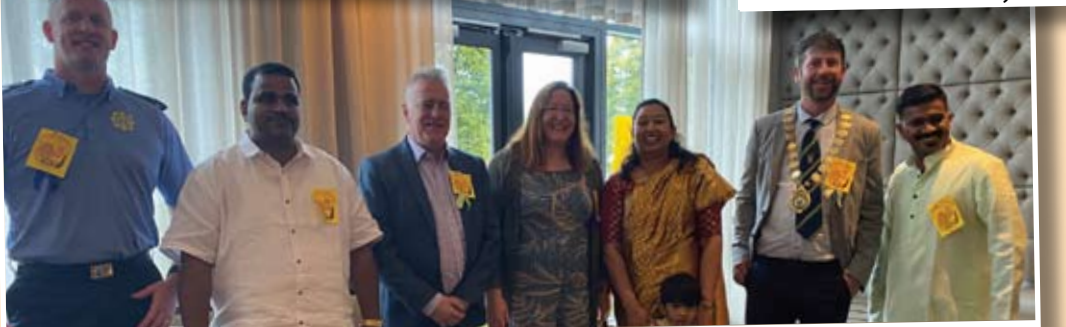
Onam Ponnonam 2022 - Indian Harvest festival