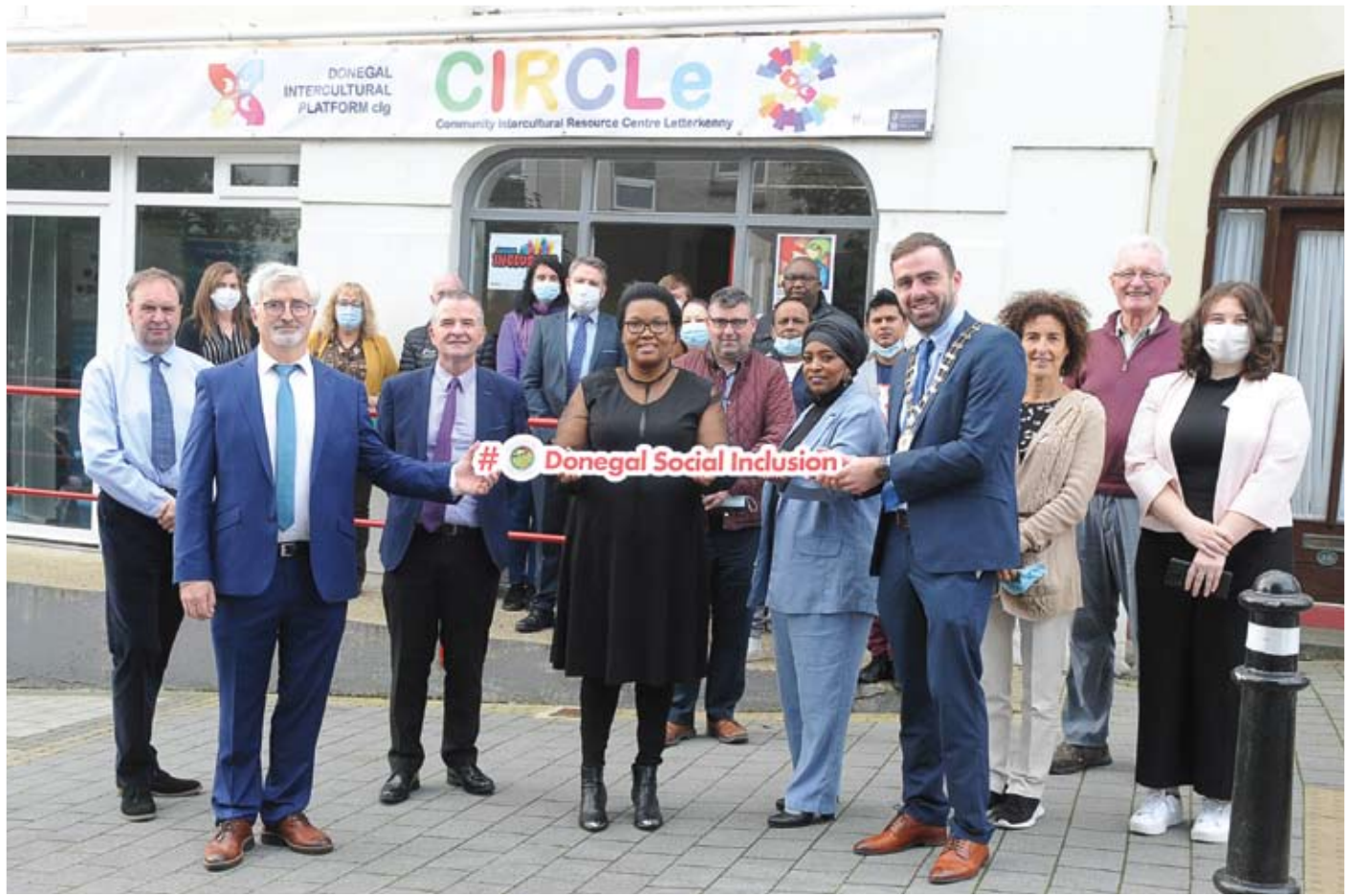
Social Inclusion Launch 21